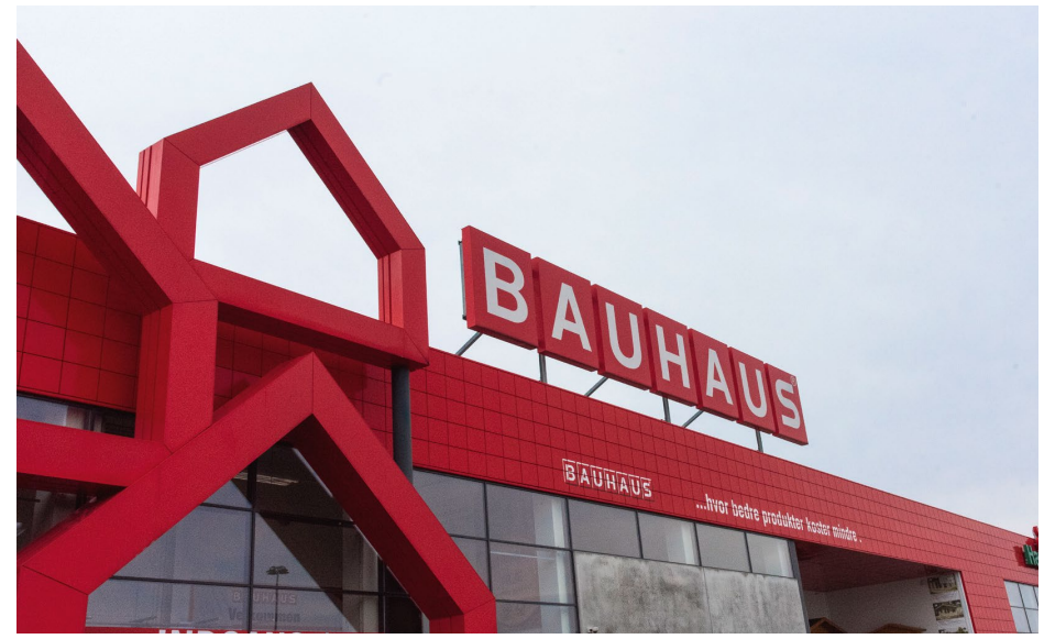
BAUHAUS has a solid market position with 18 DIY stores spread across the country.